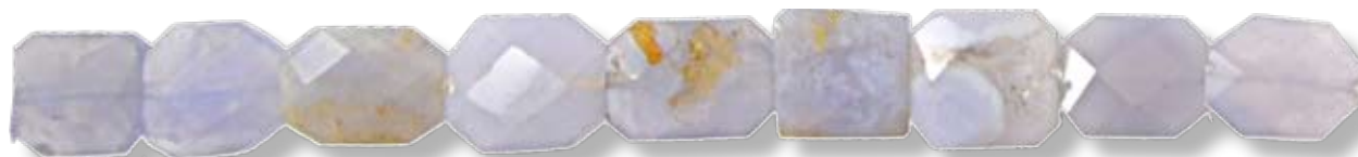
Rectangle 20x15mm CALR009