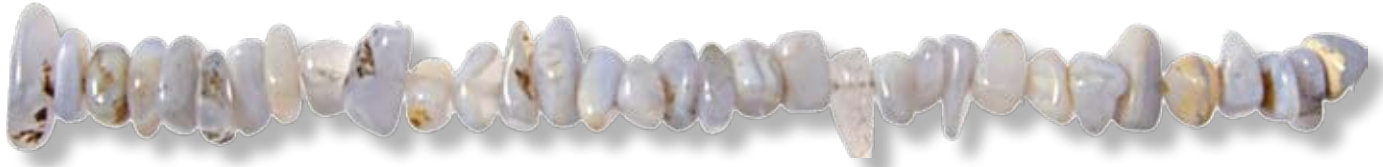
Chips 10mm CALR010