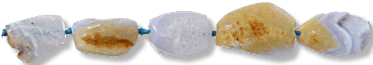
Roulée 30x25mm CALR012