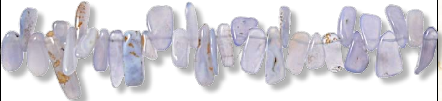
Chips 20mm CALR011